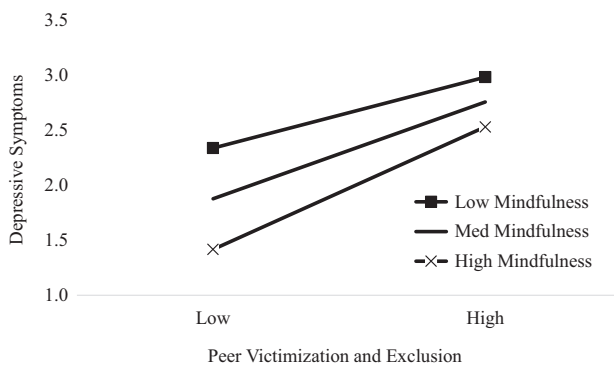
Figure 2. Associations between peer victimization and exclusion and depressive symptoms at low, medium, and high levels of dispositional mindfulness. Low mindfulness, n = 130 ; medium mindfulness, n = 104 ; high mindfulness, n = 127 .

composite PVE (dichotomous low/high) was significantly associated with more loneliness. Overall, 32.3% of the variance was accounted for by the IVs, F(4, 348) = 41.42, p < .001 . When the moderator term was examined in Step 2 of this model, a significant moderator effect was found accounting for a significant 1.0% of the variance in loneliness, \beta = .13, F(1, 347) = 5.22, p = .02 . Simple slopes analysis indicated there was a significant positive association between PVE and loneliness when dispositional mindfulness was low, B = 0.56, p < .001 , and the associations were stronger at medium, B = 0.74, p < .001 , and high levels of dispositional mindfulness group, B = 0.91, p < .001 (see Figure 3).