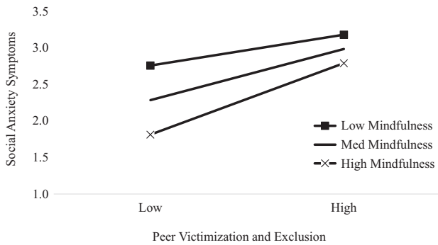
Figure 1. Associations between peer victimization and exclusion and social anxiety symptoms at low, medium, and high levels of dispositional mindfulness. Low mindfulness, n = 130 ; medium mindfulness, n = 104 ; high mindfulness, n = 127 .